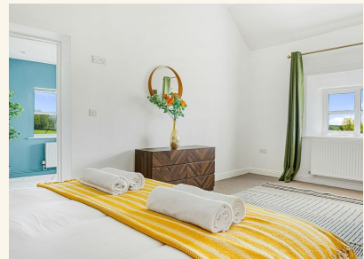
THE MASTER BEDROOM