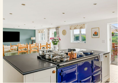
THE AGA KITCHEN