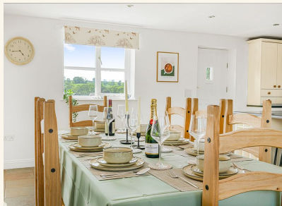
THE LONG TABLE