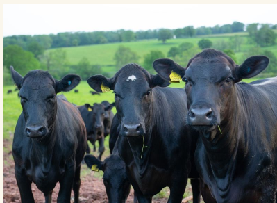
BIG SKY, FENCED FIELDS