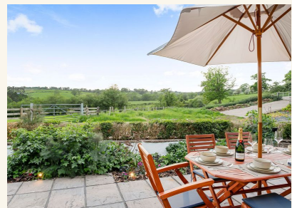
TERRACE, GOLDEN HOUR