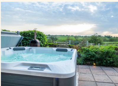
HOT TUB, SUNSET