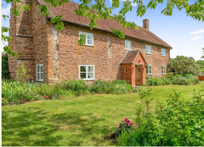
THE FARMHOUSE, WIDE

Twelve shots from the property and the surrounding estate. Higher-resolution images on request.