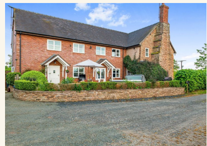
THE REAR AND YARD