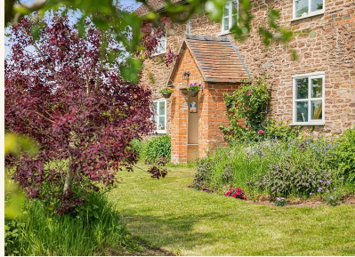
THE FARMHOUSE, FRAMED